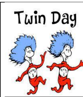
Twin Day (Head – to – Toe) (Head – to – Toe)