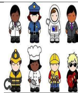
Career Day (Head – to – Toe)