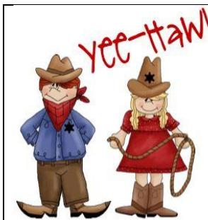
Cowboy Day (Head – to – Toe)