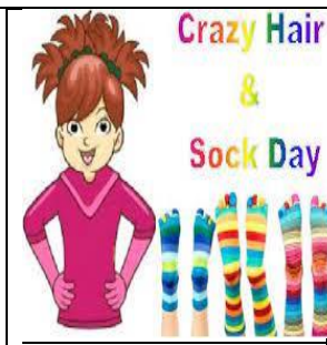
Crazy Hair/Sock Day (Uniform)