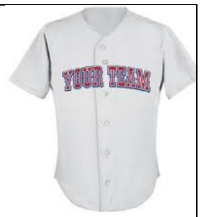
Jersey Day (Uniform Bottoms)

Mon. Jan. 22 Library Day Thur. Jan. 25 Hot Lunch – Pizza – hosted by 1 st Fri. Jan. 26 School Mass @ 8:00 AM – 6 th Grade Mon. Jan. 29 – Fri. Feb. 2 nd Catholic Schools Week Mon. Jan. 29 Cowboy Day (Head – to – Toe) Tue. Jan. 30 Crazy Hair/Sock Day (Uniform) Wed. Jan. 31 Twin Day (Head – to – Toe) Thur. Feb. 01 Career Day (Head – to – Toe) Fri. Feb. 02 Jersey Day (Uniform Bottoms) Sat. Feb. 03 36 th Annual Benefit Raffle Dinner.