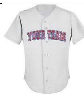
Jersey Day (Uniform Bottoms)