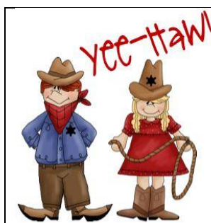
Cowboy Day (Head – to – Toe)