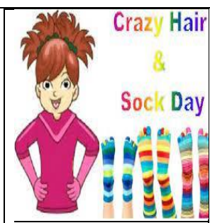
Crazy Hair/Sock Day (Uniform)