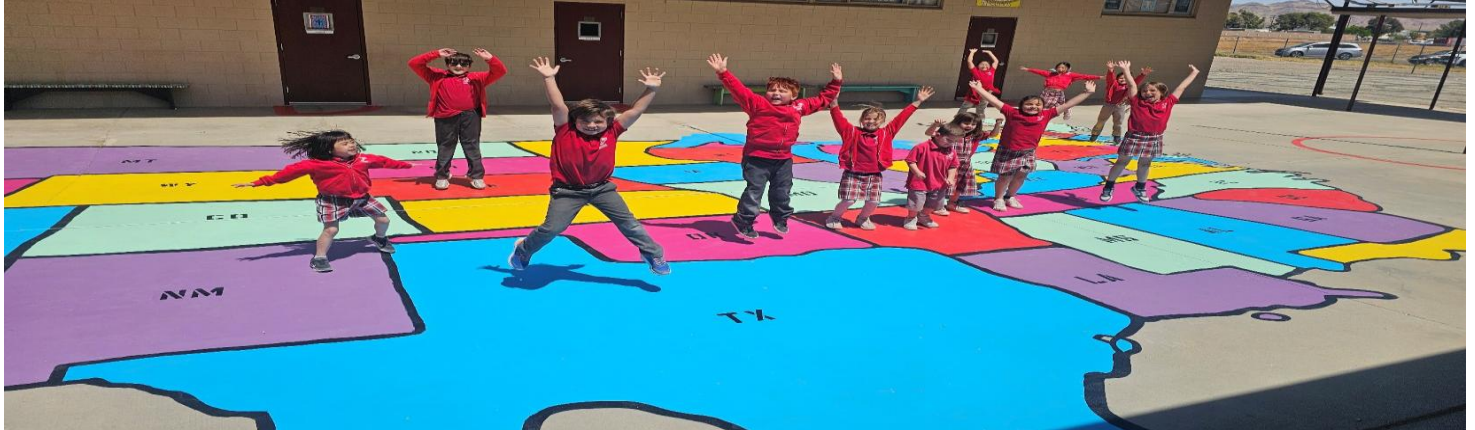
Thank you Scouting America Troop 760 for the beautiful fresh paint in our quad! Our Saint Ann students are jumping with joy!